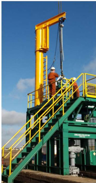
Rigless Intervention Unit